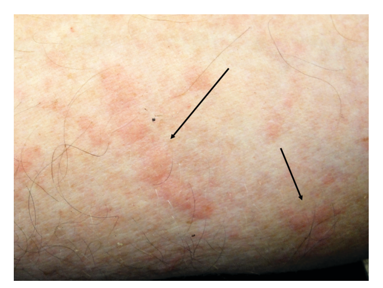
Figure 6. Bed bug bites

Both nymphs and adults typically feed at night but hide in nearby crevices and cracks during the day. Their small size and flattened bodies make it easy for them to hide in the seams of mattresses and box springs, cracks in bed frames and bedside tables, under loose wallpaper, behind wall hangings, and in other furniture. Although bed bugs do not live in nests or colonies, they do tend to congregate around good hiding places. These areas are usually evident because they are stained with dark red to blackish spots, which is dried bug excrement (Figure 4). There may also be eggs, eggshells, and the brownish molted skins (exuviae) of the maturing bugs (Figure 5).