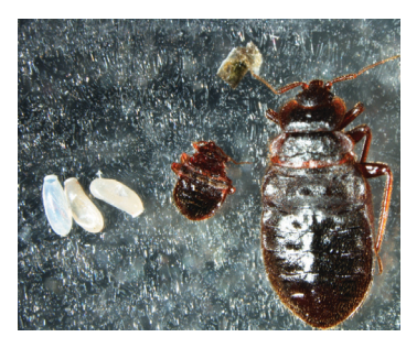
Figure 2. Eggs, nymph, and mature bed bug