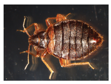
Figure 1. Bed bug

For several years, reports of infestations have become frequent in homes, hotels, dormitories, and other locations. Bed bugs are most often associated with clutter and filth, but infestations have also been reported in the finest hotels and living accommodations. Although there is no specific explanation for the resurgence of this pest, increased international travel and pesticides with reduced residual activity have probably contributed.