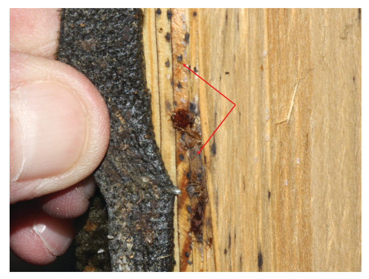
Figure 4. Dried bug excrement

bug. Saliva may produce swelling and itching, and these areas may become infected if scratched.