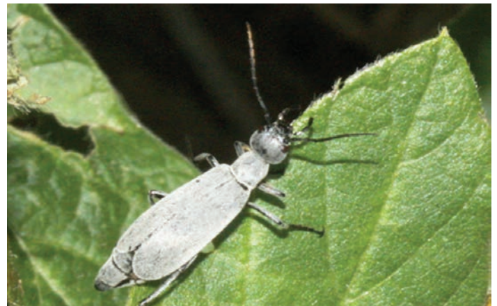
Figure 1. Ashgray blister beetle.

tible to blister beetle poisoning (cantharidiasis). Blister beetles can be crushed and killed as alfalfa is swathed. When hay is baled, bodies of dead beetles, which still contain cantharidin, may be incorporated into bales. Contamination may not be visible if beetles are crushed during haymaking. Once contaminated, hay does not lose toxicity. Cantharidin does not break down when heated or dried.