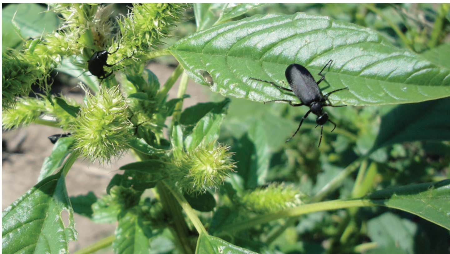
Figure 2. Black blister beetles on the weedy margin of a field. Blister beetles are strongly attracted to pollinating weeds.