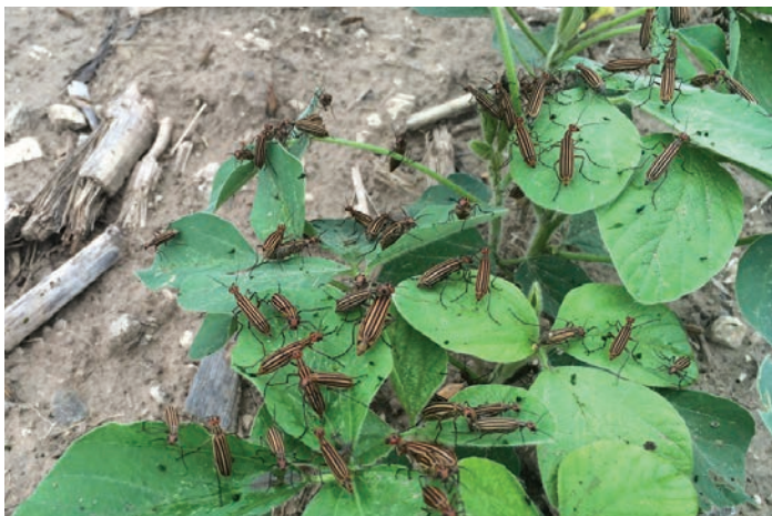
Figure 3. Aggregation of striped blister beetles on soybeans.

Striped blister beetles may be present in Kansas alfalfa fields from mid-June through mid-September with peak populations typically occurring from the end of June through the end of July. Overall, second through fourth cuttings present a greater risk than other cuttings. The first, peak, and last appearance of blister beetle species known to occur in Kansas alfalfa are shown in Figure 4. Nationwide, blister beetles occur throughout all alfalfa growing regions. Species composition, seasonal occurrence, and abundance vary widely among geographic production regions.