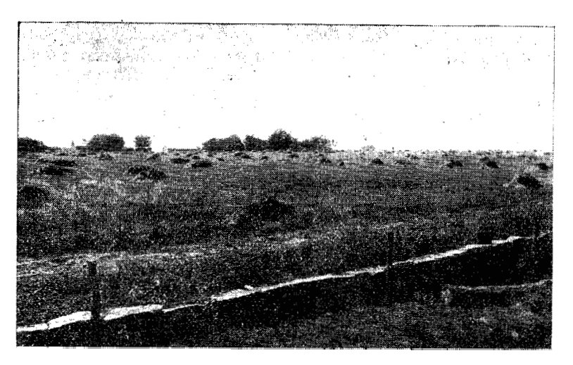
KANOTA: AN EARLY OAT FOR KANSAS<sup>1</sup>