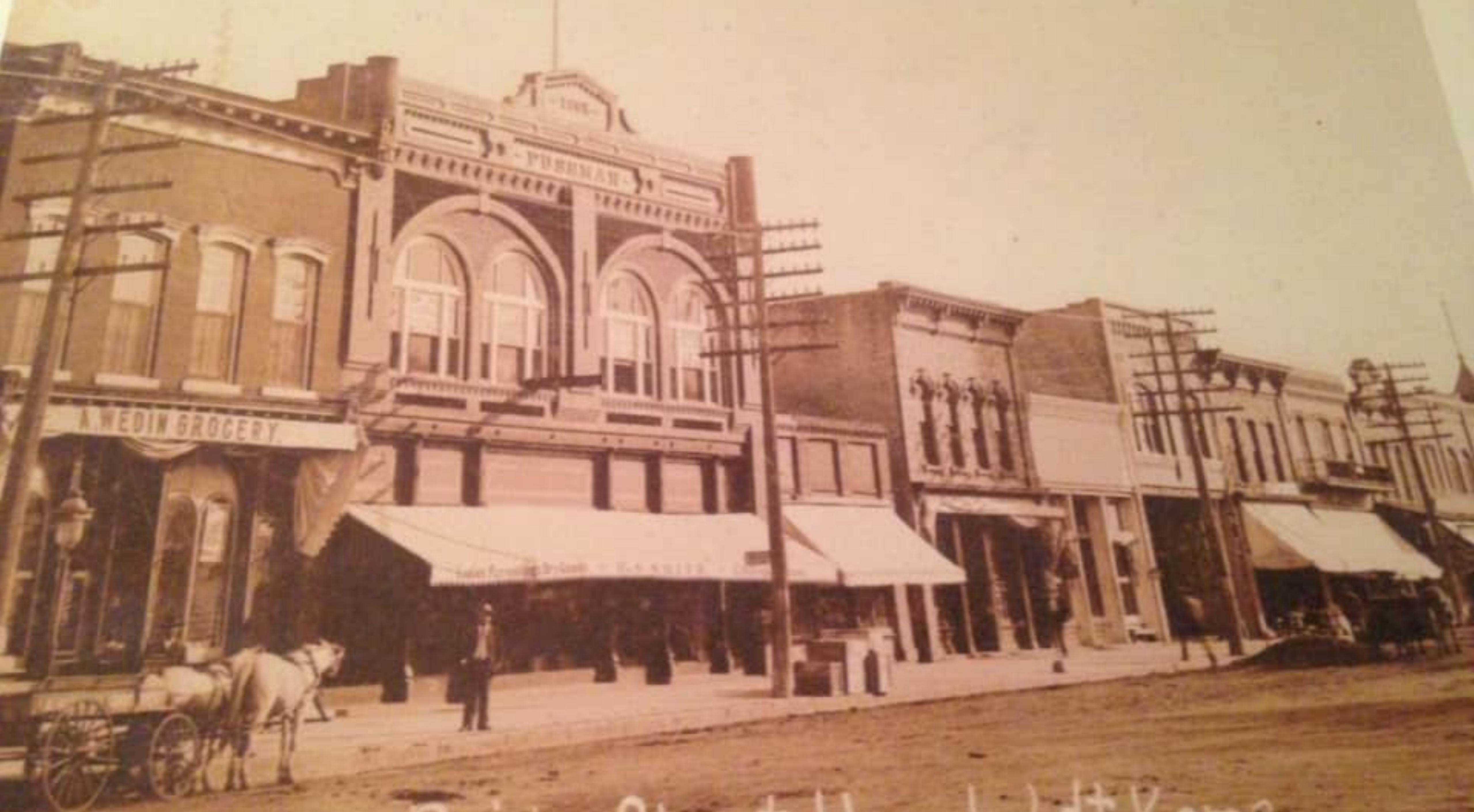
100 - B. 1st Street Humboldt Kansas