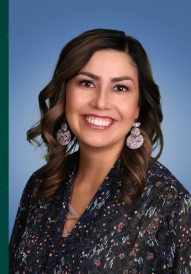
Dalila Boys Dodge City/Ford County