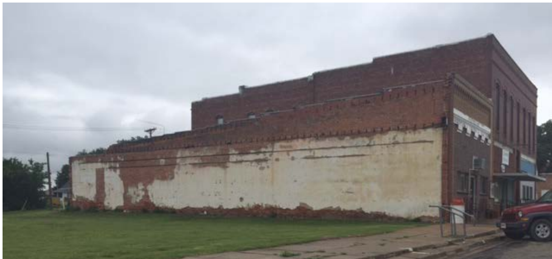
Side of Building