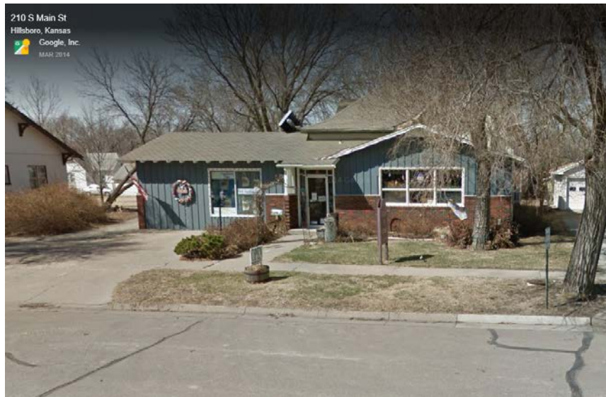
Google Earth, March 2014 Captured October 2017