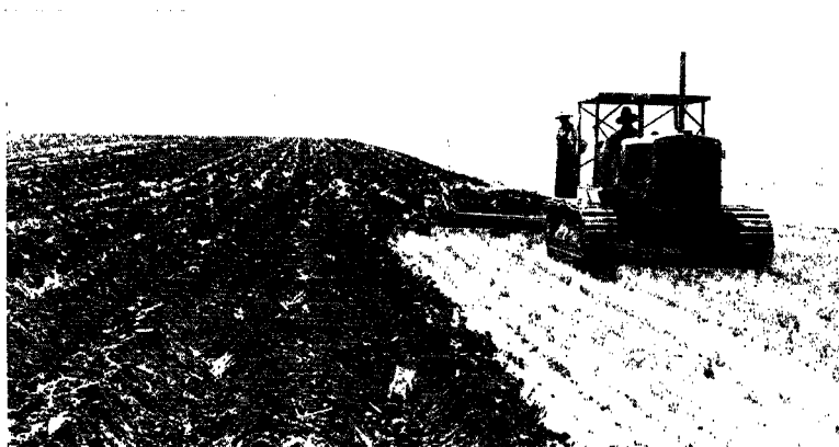
FIG. 2.—Blank listing after harvest, an operation sometimes used as the first step in the preparation of a seedbed for winter wheat.