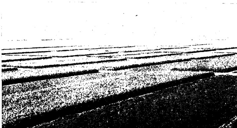
FIG. 1.—General view of experimental plots of the Division of Dry Land Agriculture, United States Department of Agriculture, on the Fort Hays branch of the Kansas Agricultural Experiment Station, Hays, Kan. The picture was taken June 6, 1922.