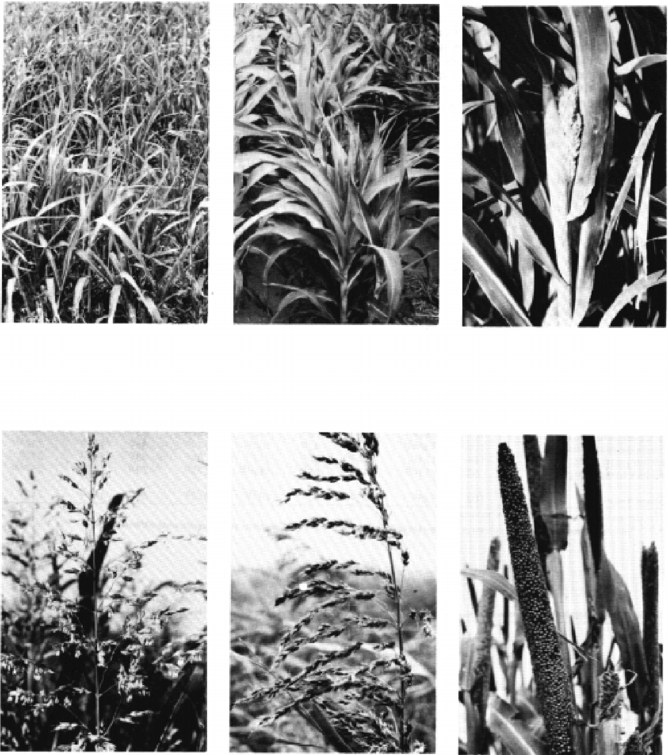
Figure 1. Summer annual forages at different stages of maturity: Piper sudangrass, vegetative stage (top left); FS 25A forage sorghum, vegetative stage (top center); FS 25A forage sorghum, boot stage (top right); Piper sudangrass, anthesis (bottom left); Piper sudangrass, dough stage (bottom center); Millex pearl millet, dough stage (bottom right).