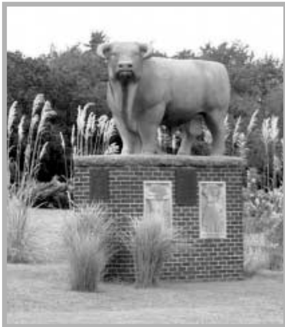
75th-anniversary limestone bull.