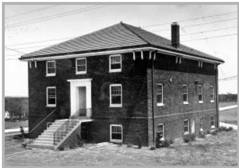
Crops laboratory building, 1934. This was the only brick building on the Station financed by State-appropriated funds.

fees, that is money available from the sale of products from the Station, varied during those first 25 years from just over $600 in 1903 to more than $50,000 in some of the later years. Then as now, fee collections depended largely on the amount and price of seed sold and on prices received for livestock and other commodities. In most years prior to 1919, appropriations exceeded expenses for salary and labor. Several positions were financed largely by the USDA. No reliable record was found of the size of the labor force during those early years. But beginning in 1919, the salary and labor expenditures exceeded the appropriations nearly every year. This points out that many of the improvements seen on the Station resulted from judicious use of funds generated from sources other than state appropriations. These funds not only paid for many of the buildings that are presently on the Station, but also paid for new machinery, machinery replacement and covered general ongoing expenses. The wisdom of allowing the Station to accumulate money in the fee account as opposed to turning it over to the state general fund and relying on adequate appropriations could be debated. Annual appropriations sufficient to operate the Station might have alleviated some of the