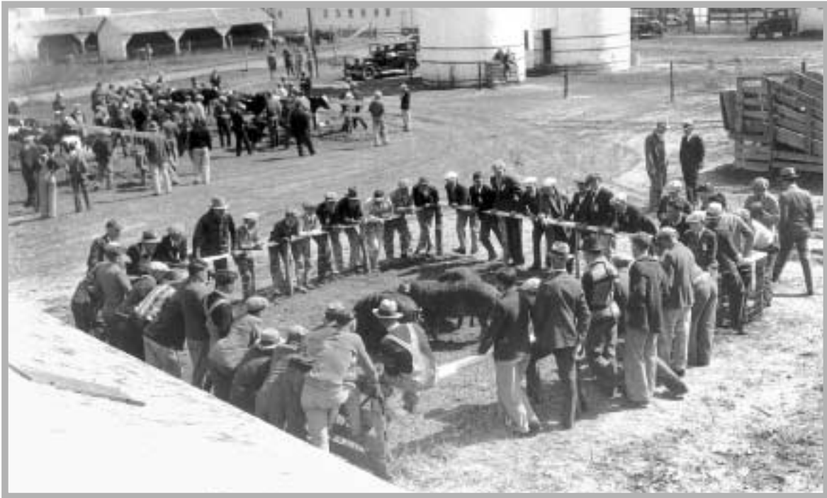
Facilities used for Judging Contest, 1932.

shown important relationships between dry matter content and resulting silage quality, demonstrated variation among sorghum varieties, and established that silage additives then available did not improve quality sufficiently to provide an economic response. The Station was