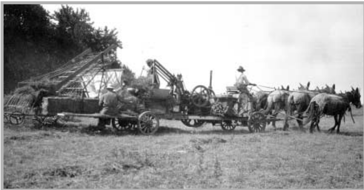
Baling hay directly from the field in 1926. This may be the first pick-up baler ever used.

The list of buildings constructed and changes made in the physical plant between 1922 and 1927 is indeed impressive. In 1925, the first significant greenhouse was erected to replace an old small greenhouse. Some beef cattle barns were moved from the south end. Mr. Aicher recorded moving the old sheep shed and rebuilding the old buggy shed, but neither of these buildings was identified further. He remodeled the old stone barn located at that time near the present auditorium. The barn later was moved to make room for the present-day auditorium. He completed the two-story wooden machine shed that now houses the maintenance shop on the lower level. Originally, the machine shop occupied that area. The roof on the old sheet-metal machine shed, the present metal building that sits east of the office building, was replaced. The dryland agriculture field buildings were erected to accom-