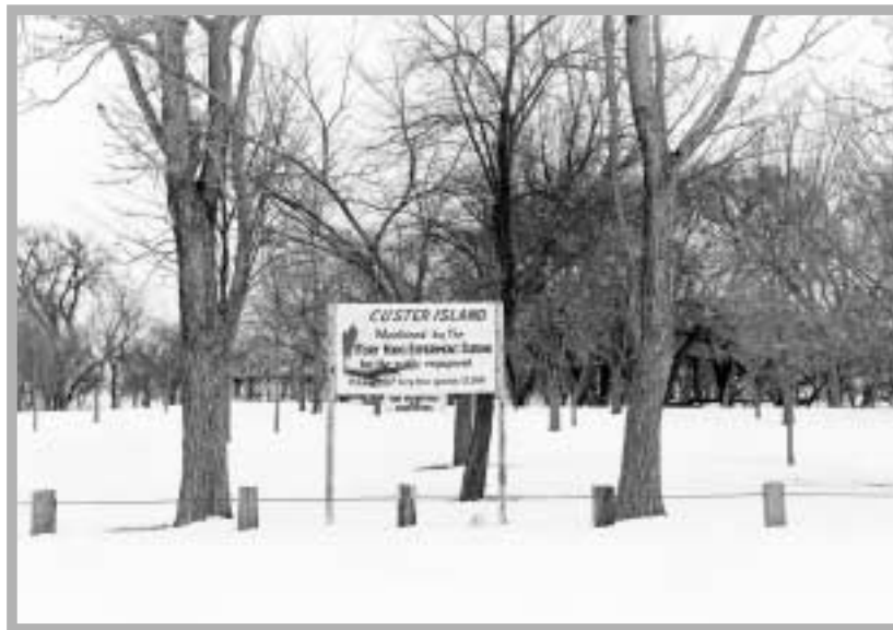
Custer Island picnic area, 1952.

early in the Station's history as a family picnic area, was located in a bend of Big Creek. Despite the name we know that General Custer's campground was located a short distance downstream. It was a delightful area for family outings, and several improvements were made over the years. A dam across the creek created a pond. Shelter houses and rest rooms were constructed, and a cable-suspension foot-bridge crossed the creek.