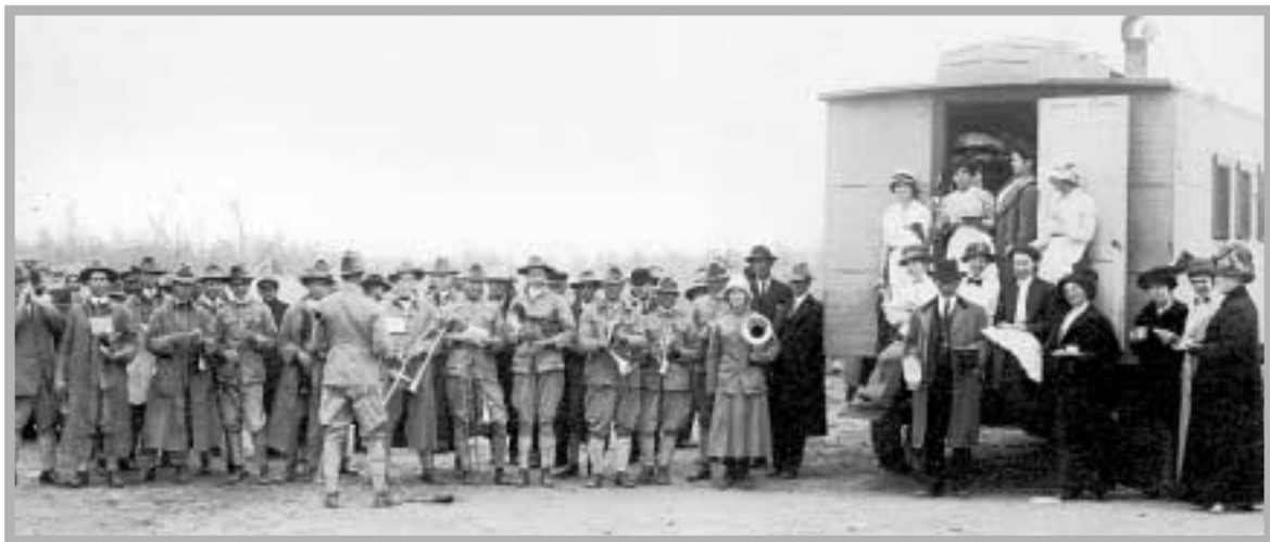
"Entertainment" at the second annual roundup, April 1, 1915.

Results of the beef cattle work have been reported to the agricultural community through an ongoing series of publications that began with a mimeographed circular in 1913. The first recorded reference to Roundup appears in the 1914 Circular entitled "Roundup on The Fort Hays Reservation." Since that field day on May 1, 1914, Roundup has been a fixture at the Experiment Station. It has been held each year except 1945 when German prisoners of war were housed in the livestock research area. Roundup reports have been published in all but two years, making it one of the longest series published by any public research agency. For many years, the Roundup reports consisted almost entirely of data recorded from the various experiments with little or no interpretation. There seemed to be a reluctance to summarize the data and to formulate any type of recommendation. Rather, the philosophy seemed to be, "Only the facts are given. Draw your own conclusions." This same philosophy was evident in publications from other research projects. Changes needed to overcome