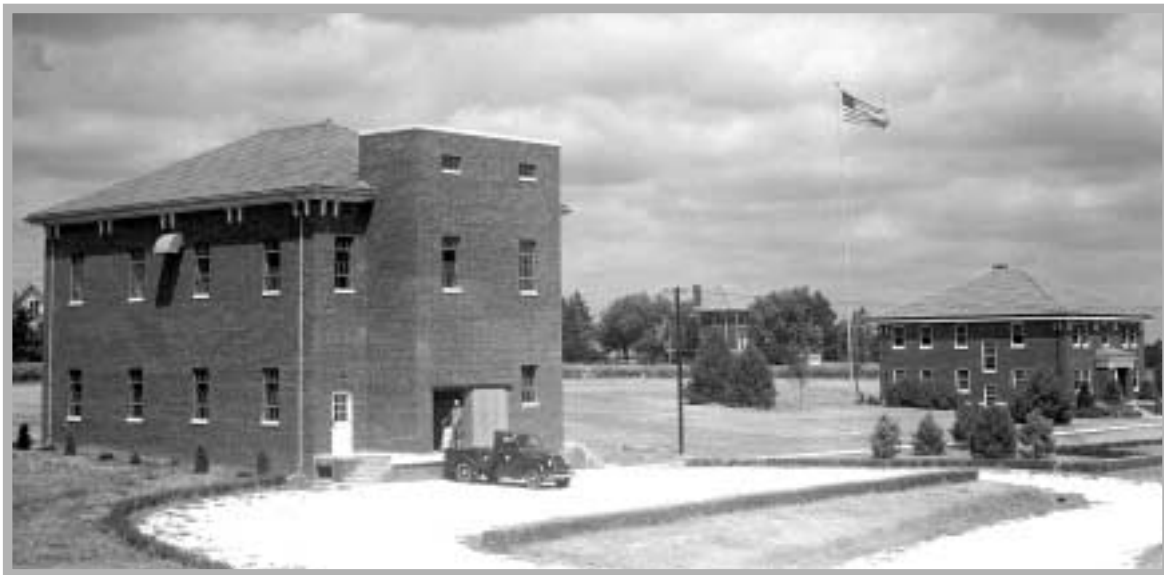
Seedhouse completed in 1942. Construction began in 1940, but lack of funds delayed completion.

The first indications of the effect of the great depression and later the drought of the 1930's were evident in 1931 when the Station's income was less than half that of some previous years. That meant few improvements could be made during the year even though 1931 crop yields were excellent, and Mr. Aicher wrote in 1932 that wheat and sorghum "produced enormously". Reported yields in 1932 included one field of Wheatland milo that yielded 71.5 bushels per acre and wheat averaged more than 39 bushels per acre. These