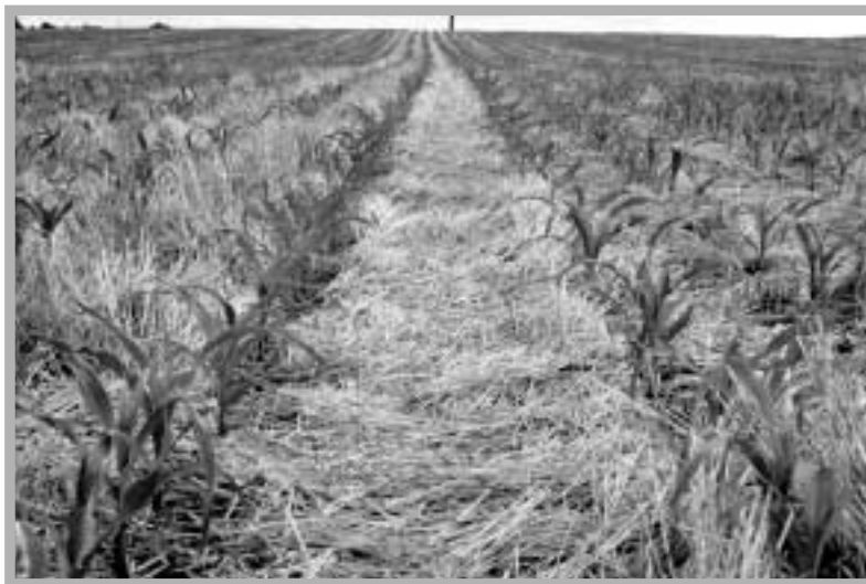
Sorghum growing in the previous year's wheat stubble. The Station began using this system in the 1960's.

Although field bindweed control was Timmons' primary concern, he expanded weed control work into other areas. The greatest change came in 1945 when the new herbicide 2,4-D became available. Timmons was one of the first civilians to be allowed to test this herbicide, which had been developed for possible military use during World War II (but was not used). It was the first highly selective, growth-regulating