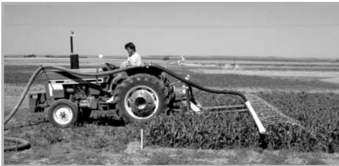
Applying fertilizer to plots that previously had paper and yard wastes incorporated into the soil.