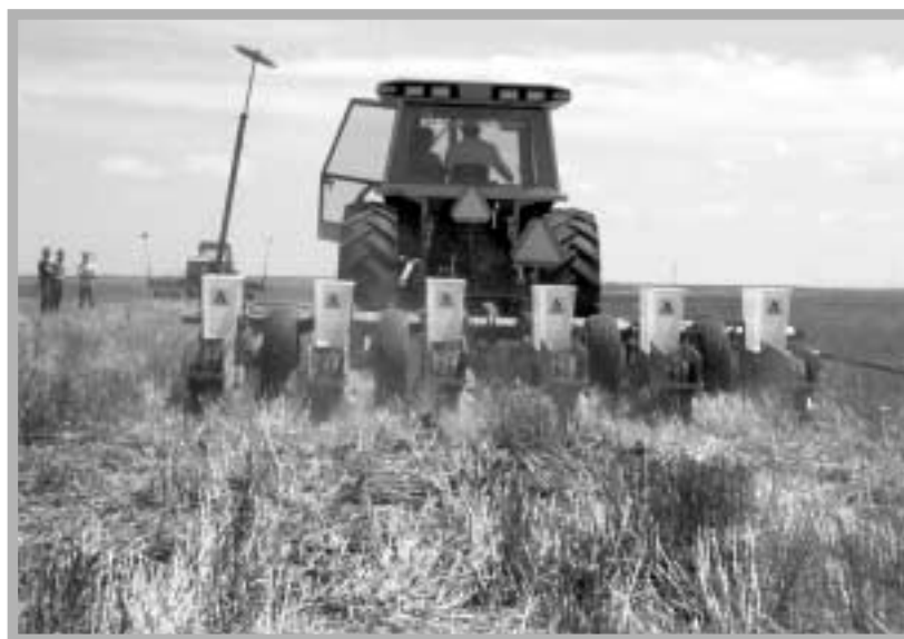
Planting sorghum in undisturbed wheat stubble, thus the soil had been protected from erosion since the previous year's wheat harvest.

The first experiments consisted of 16 treatments with smother crops and cultivation