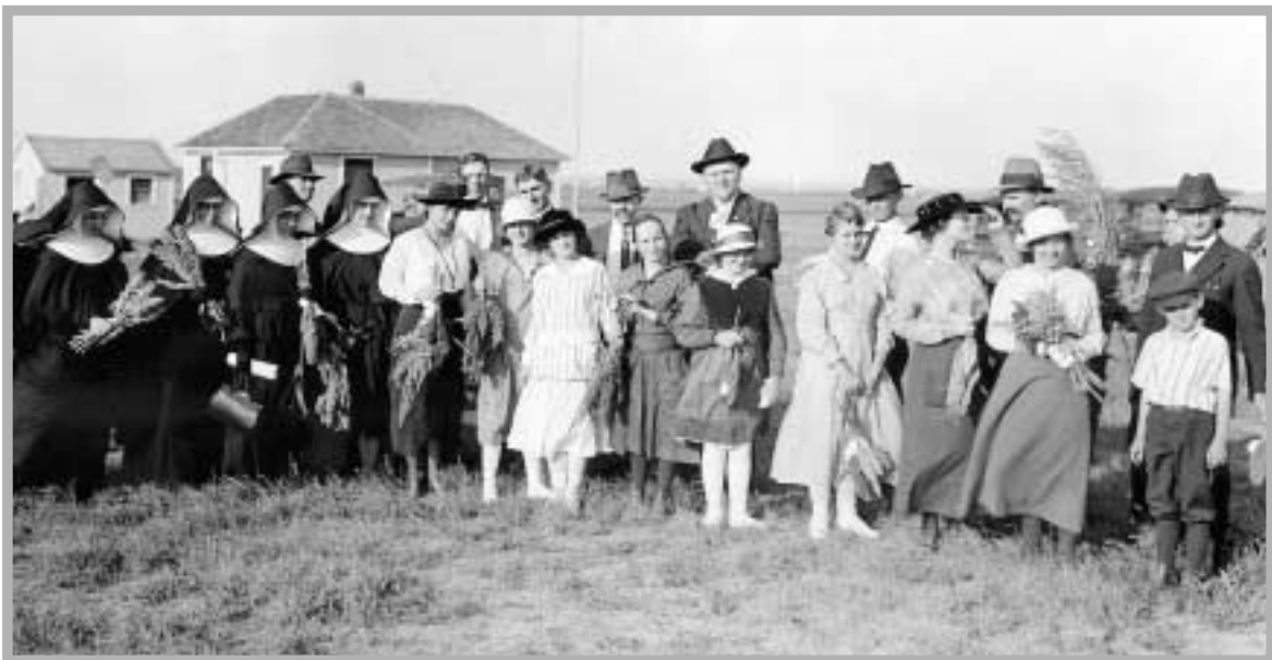
These teachers came in 1917 to study sorghum varieties.

Many of the Station improvements were possible only because money generated by the sale of products remained in the fee account for use at the Hays location. Then, as now, the farm produced livestock feed and pure crop seed. The livestock were used to generate research results and then marketed. Thus, much of the feed crop production was marketed through livestock. Seed sales not only generated money for operations, but, more importantly, provided pure seed of improved crop varieties to farmers. But as Weeks continued to point out, depending on these sales to provide