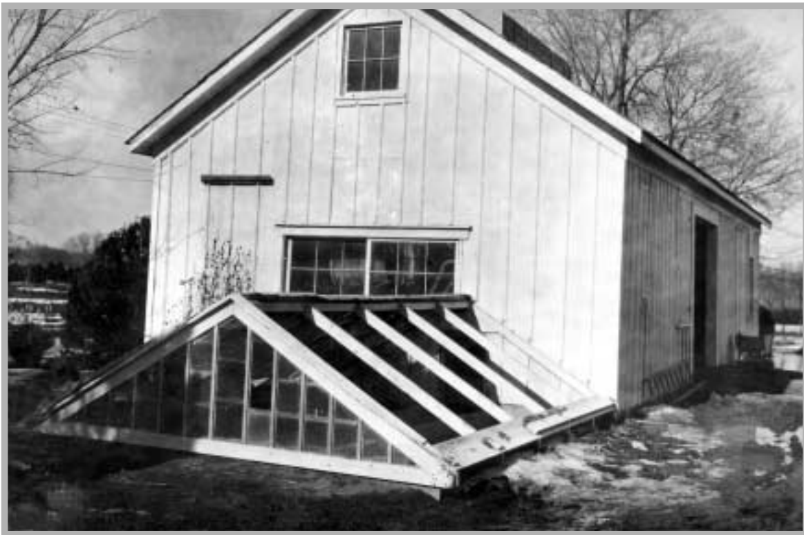
In 1925 only a small, inadequate greenhouse was available.