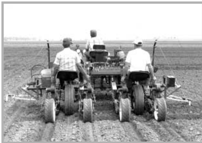
Seeding wheat breeding plots with a 2-row tractor mounted planter. As late as the 1950's this was done entirely with manpower.

more important are germplasm lines that can be used by plant breeders throughout the world to develop improved varieties of wheat. In addition to varieties released for farm production, the wheat program has developed and released some 18 or more germplasm lines that were made available to all public and private breeding programs. These included some of the original genetic resources used in the early hybrid-wheat program and newly developed lines with improved co-