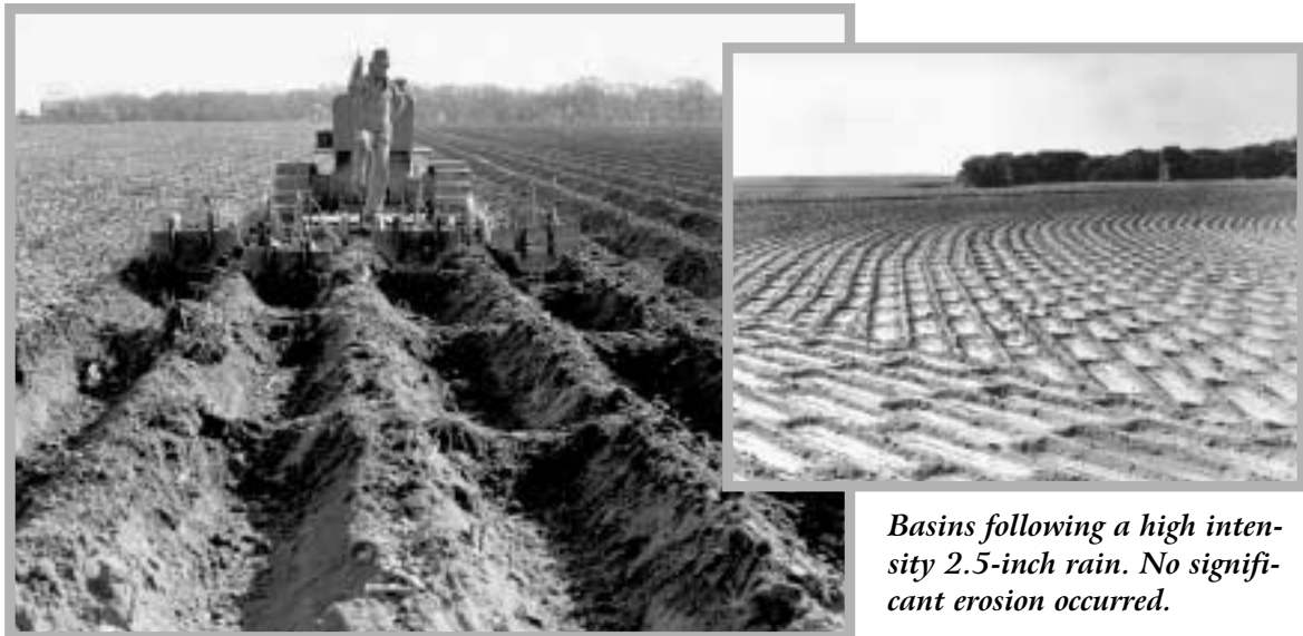
This 4-row basin lister created dams to retard erosion.

During the early 1930's, hope still existed that the area could be used for some fruit production, and a thousand cherry trees of several varieties were planted in 1930 along with 10 varieties of plums. These trees began producing in a couple of years and remained in