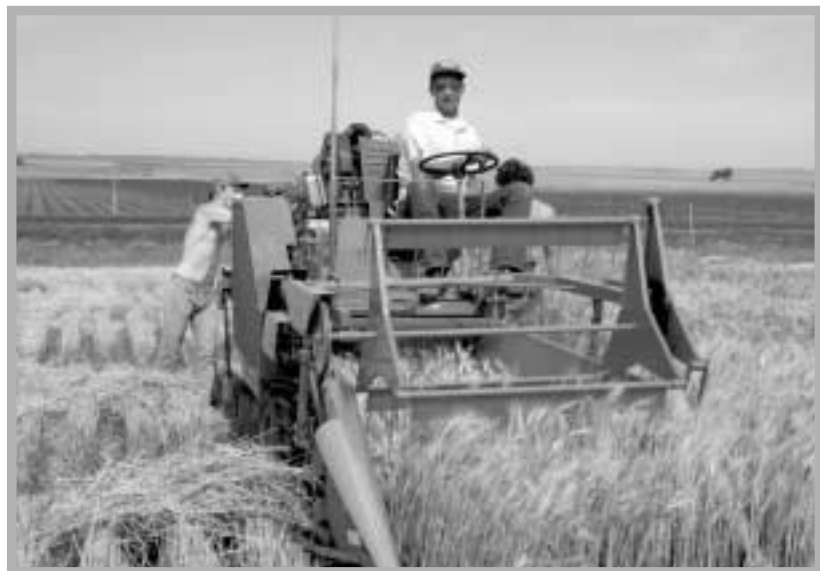
A modern self-propelled plot combine.

As pointed out, sorghum was included in the demonstration plantings as early as 1902. Most sorghum varieties were tall forage types with comparatively low grain yields. The first important grain variety, Pink Kafir, was selected about 1912 and was an important part of the grain sorghum production for many years. Swanson believed that sorghum improvement was fully as important as the wheat work, and he began selecting and breeding to improve the existing varieties. Wheatland, the first combine-type sorghum to be grown widely, was brought to the Station in 1929 and released in 1931. Westland, a variety developed at the Garden City Experiment Station, and Midland, developed by Swanson, replaced Wheatland. These were the leading varieties until sorghum hybrids became available in the 1950's. Midland seed sales played an important role in the Station finances during the 1940's. In 1945, approximately 250,000 pounds of seed were distributed. Other grain sorghum varieties developed by Swanson included Early Kalo, Club Kafir, and Cody. He also began extensive work to improve forage varieties. The available varieties, such as Red