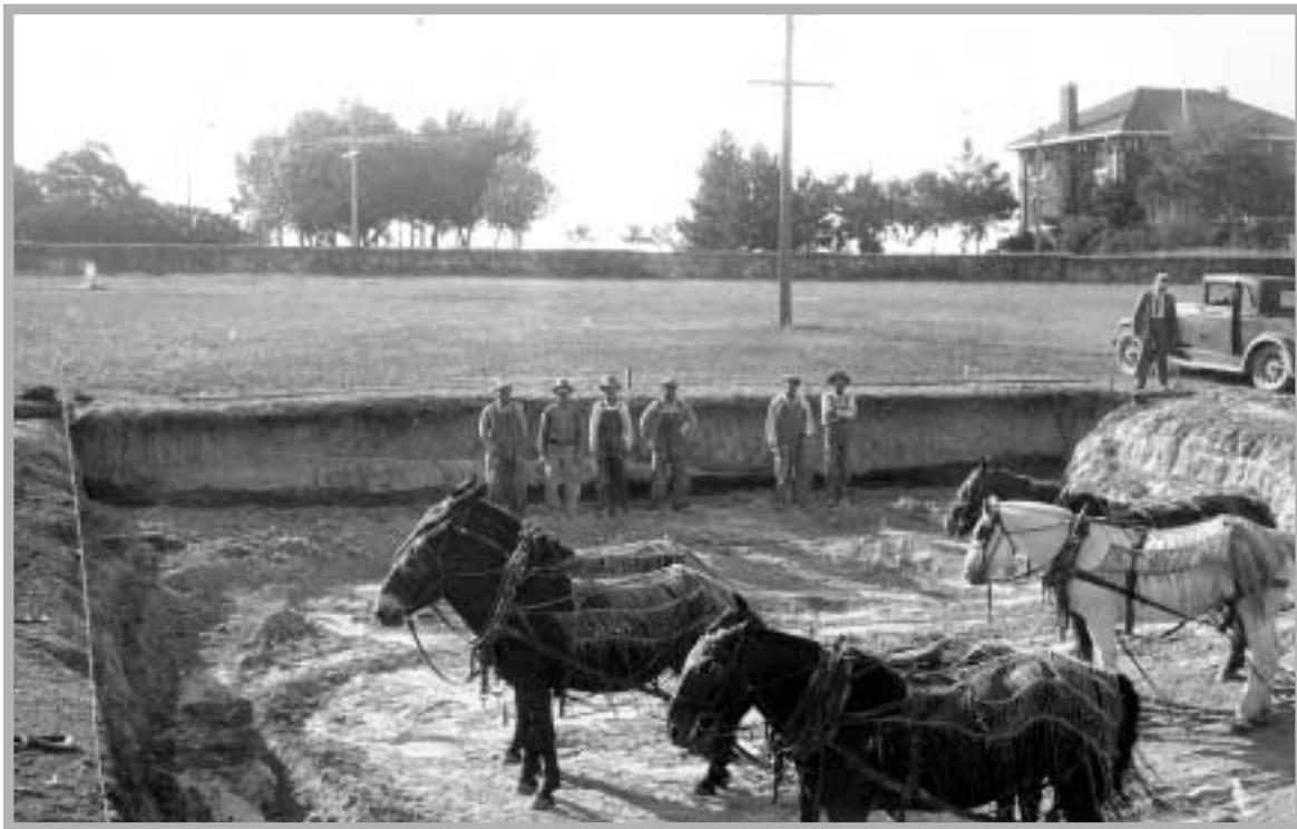
Digging basement for new office building, 1930.