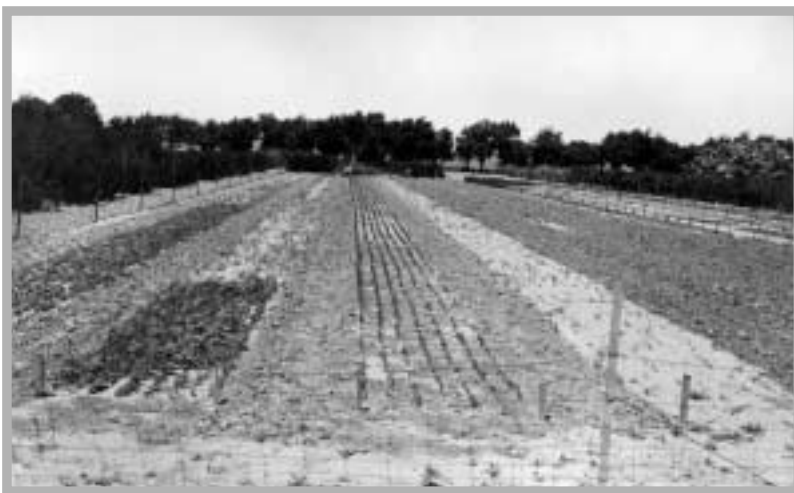
Tree seedling beds in the State Forest Nursery. Several million trees were distributed from about 1910 through 1952.