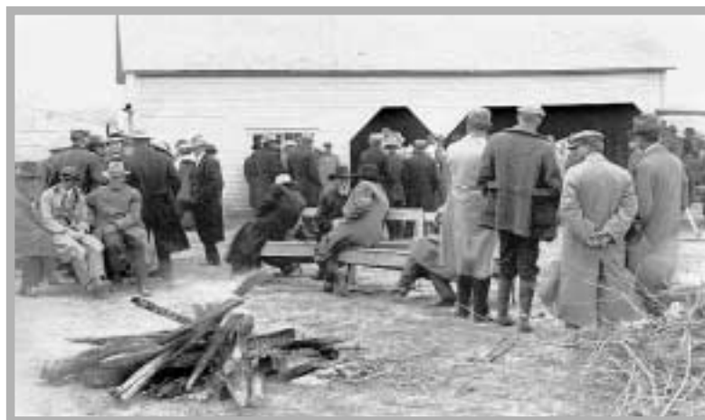
Crowd assembled for the second annual Roundup, April 1, 1915.

Many of the researchers who have worked at the Station are mentioned in the following sections. A complete list is included on page 40 .