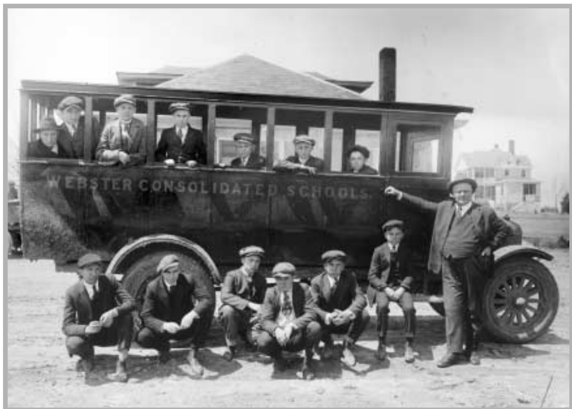
School boys and their teacher from Webster, Kansas, visited the Station in 1920.

nanced by the USDA, were well underway. Some of the USDA scientists did provide continuity that had been lacking in these projects. The beef cattle herd was established, and feeding and management research assumed increasing importance. A commercial dairy was started, but only limited research work was conducted. A sizable swine project was underway, and at least for a short time, some sheep were involved. The swine and sheep provided minimal research information, but their management could be observed by visiting farmers.