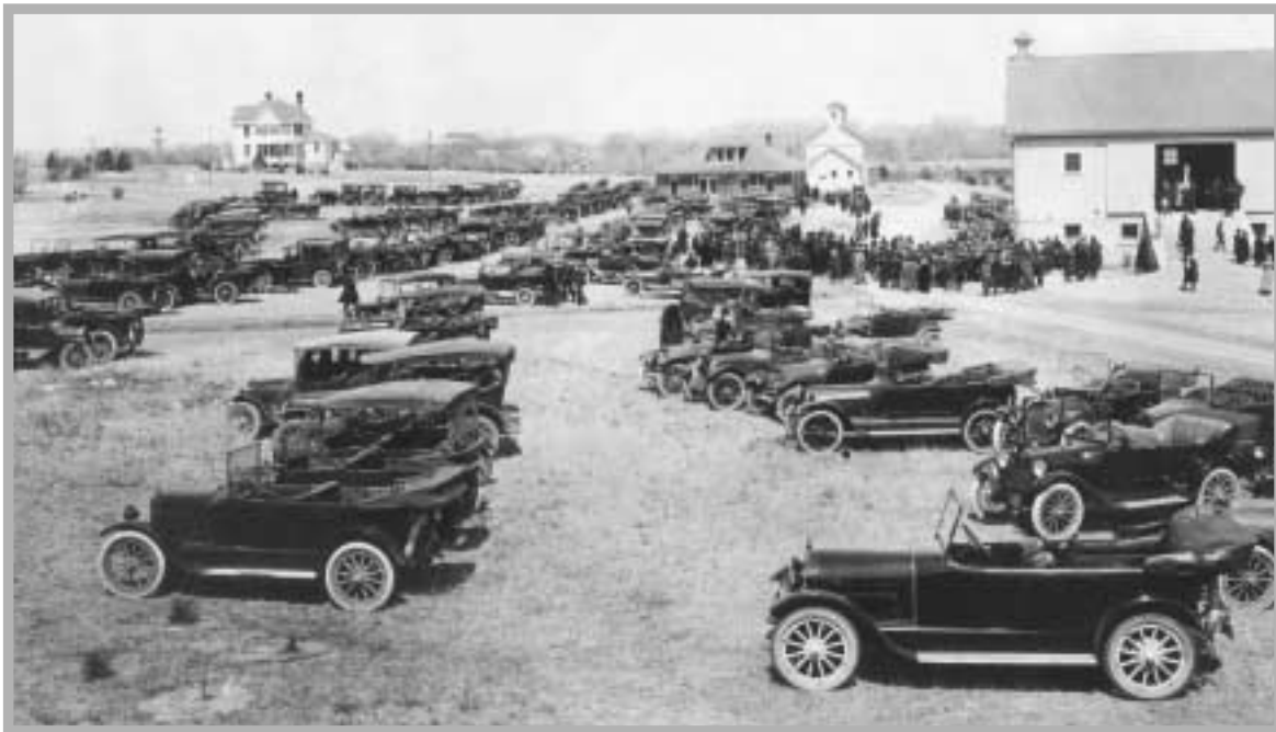
Cars and Crowd at Roundup, c.1926.

than one-fourth of the more than 1,500 head of cattle on the Station. Beef cattle nutrition work always has focused on crops grown in the area. Sorghum has been especially important, and the Station certainly has been a leader in research with this crop. From beginnings early in the century, the studies involved both grain and forage sorghums. The forage research has