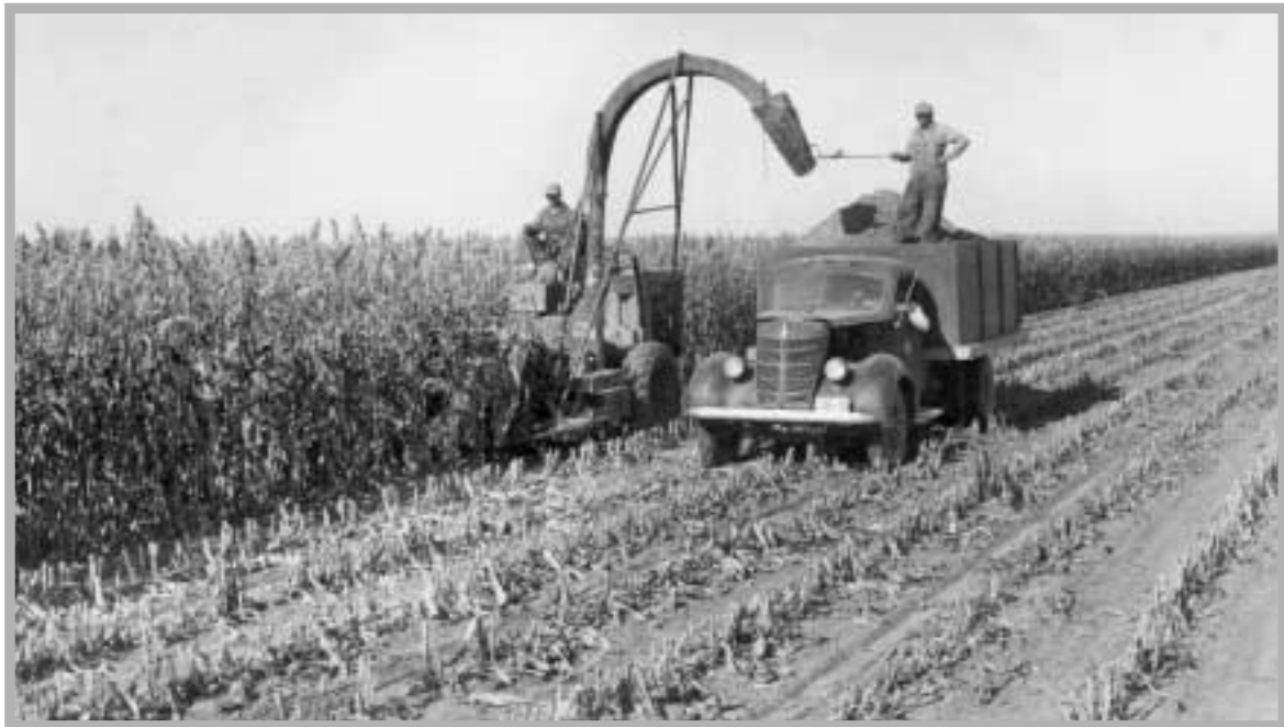
Harvesting sorghum for silage in 1950, using the Aicher-designed self-propelled field cutter.

Mr. Aicher started the last of the permanent brick buildings, the shop building, in the fall of 1951. To make room for the new shop, the building used for tractor repair had to be moved. That building was converted to a small garage and oil room. Plans for the new shop included combining the machine and tractor shops and putting coworkers in charge of each section. However, irresolvable conflicts