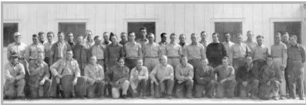
German prisoners of war in front of their mess hall, the Station auditorium.

Late in the 1940's, all of the horses and mules used as work stock were sold. By that