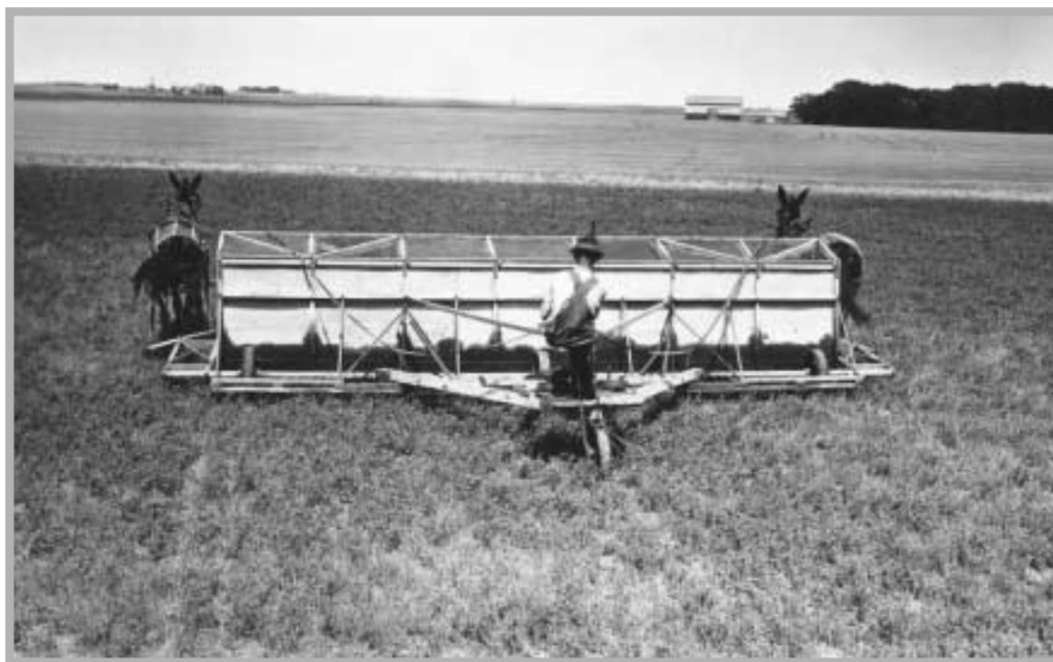
Reducing grasshopper infestation with a "hopper dozer." Modern insecticides and insect-resistant crops have reduced losses due to insects.