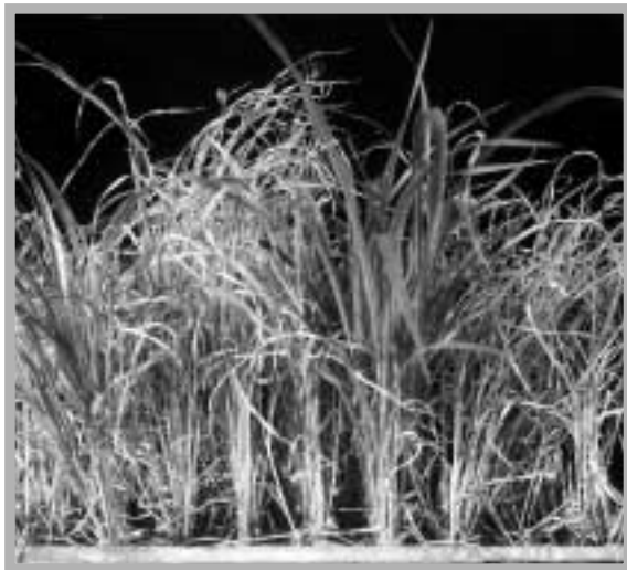
Dead sorghum plants killed by aphids vs. resistant lines developed through plant breeding and selection.