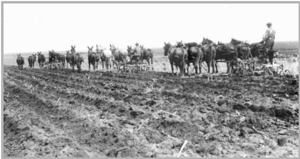
Three 6-mule teams blank listing prior to seeding sorghum in 1926.

Field bindweed, the difficult-to-control, deep-rooted, perennial weed, had been a problem on many of the fields since the beginning years of the Station. It probably was introduced as a contaminant in seed wheat prior to 1900. Some control was accomplished with repeated tillage. Early research involved heavy applications (as much as 20 tons per acre) of common salt. The salt eliminated the weed, but unfortunately affected soil productivity and physical properties for 50 or more years. A new herbi-