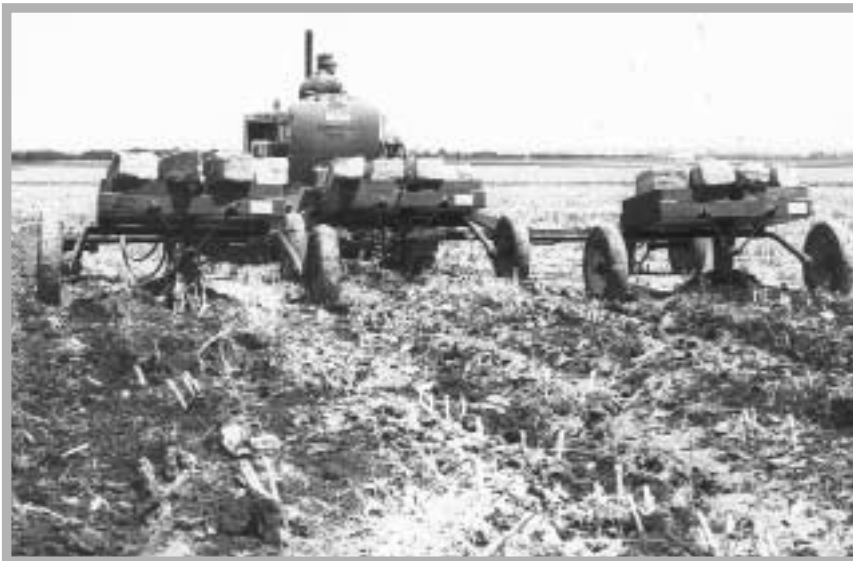
Subsurface tillage using large V-blades to retain residue on the soil surface. These implements became the tools of choice to reduce erosion.

subsurface tillage. It was the forerunner of some of the later subsurface tillage machines that are in use today. The duckfoot shovels were not more than 12 to 16 inches wide, whereas blades on the newer machines are several feet wide. A bank of six pit silos was constructed and put into use in the mid 1930's. Much of the labor for construction was furnished through the depres-