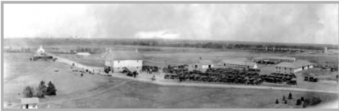
Panorama of the Station, c.1926.

Success most often is credited to administrators and research scientists, whereas the role of support personnel, such as research technicians and assistants, farm laborers, equipment operators, and office employees often is overlooked. A roster of present and past employees is presented in Appendix C. During the past 100 years, many of these employees have served even longer than the long-term scientists. Without their dedication, many of the research discoveries would have been delayed.