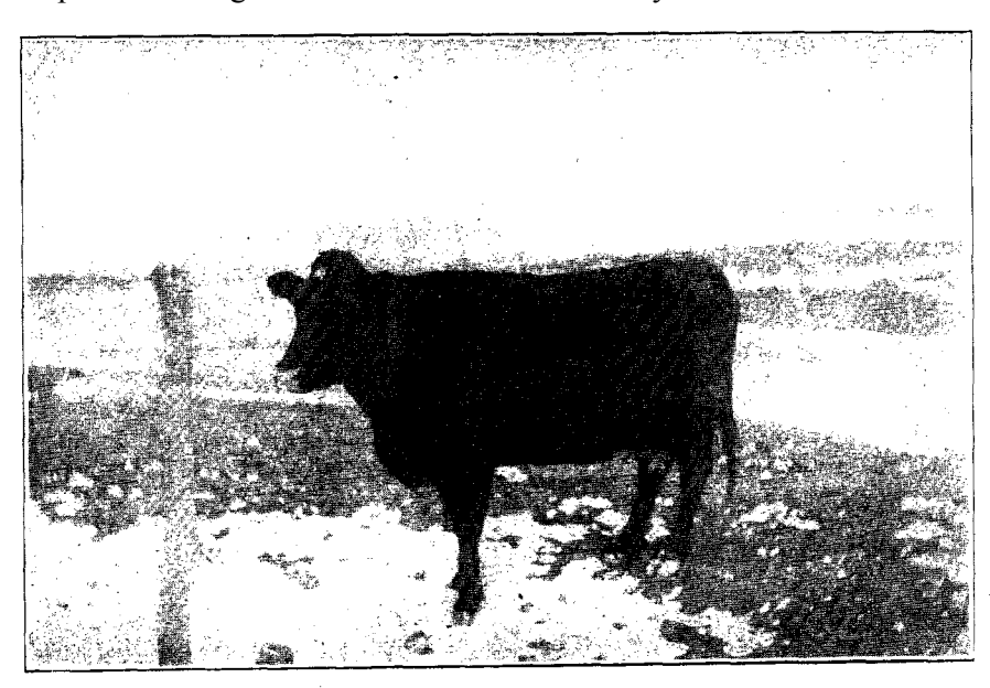
Cow No. 2.—Yearly record: Milk 1418 pounds, butter fat 59 pounds; cost of feed, $38.23. A common cow, with an uncommonly poor record of production. This cow's principal fault is that she goes dry too early. She was dry for seven months during the past year.

One of the advantages to be gained from keeping a record of a cow is brought out in the case of the grade Holstein cow that made the best record. She dropped a bull calf early in the year, and it was sold to a neighbor for $5. The cow made an excellent record for the first few months, and the bull calf changed hands at $18. When the yearly record was completed and the cow showed a production of over 540 pounds of butter fat, the calf again changed hands, at $50—a good price for a grade Holstein bull under a year old.