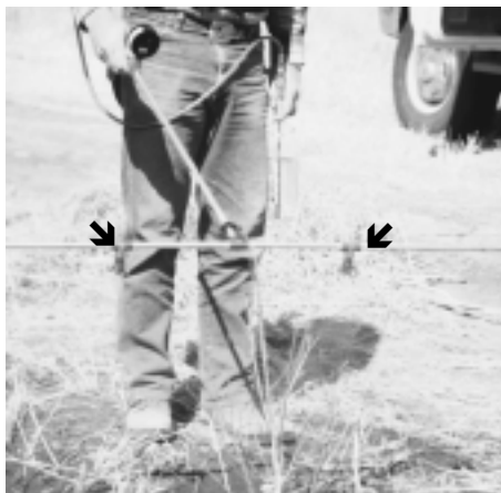
Figure 1. Spray rig used to apply herbicides over the seedlings. The nozzle positions allowed application to the side of seedlings.

Control of both broadleaf and grassy weeds is necessary for successful establishment and growth of tree plantings in the Great Plains region. Imazaquin alone may not control grasses sufficiently and needs to be combined with another herbicide, especially in the absence of adequate early spring precipitation. Pendimethalin alone and in combination with imazaquin, as applied in this study, can be used for controlling weeds with little damage noted 90 days after treatment to the woody plants tested. About 88% had slight damage or no damage, and 7% had slight damage, with slight reddening of silver maple and some brown leaves on arborvitae. Only one of the four Populus clones tested, P-26, and golden currant, showed any substantive reduction in height, and survival was good for all species. These results show that any of the four pendimethalin treatments applied during the dormant season on the 15 clones/species of woody plants studied were effective in controlling weeds while causing little or no damage to the plants.