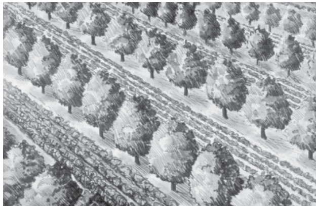
Figure 1. Schematic of alley cropping.