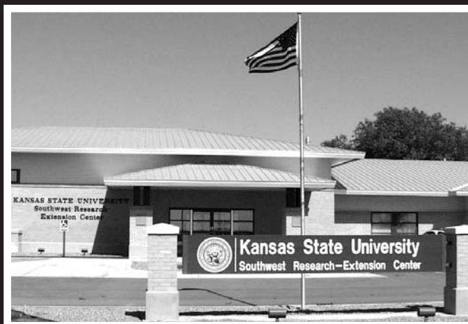
Southwest Research-Extension Center