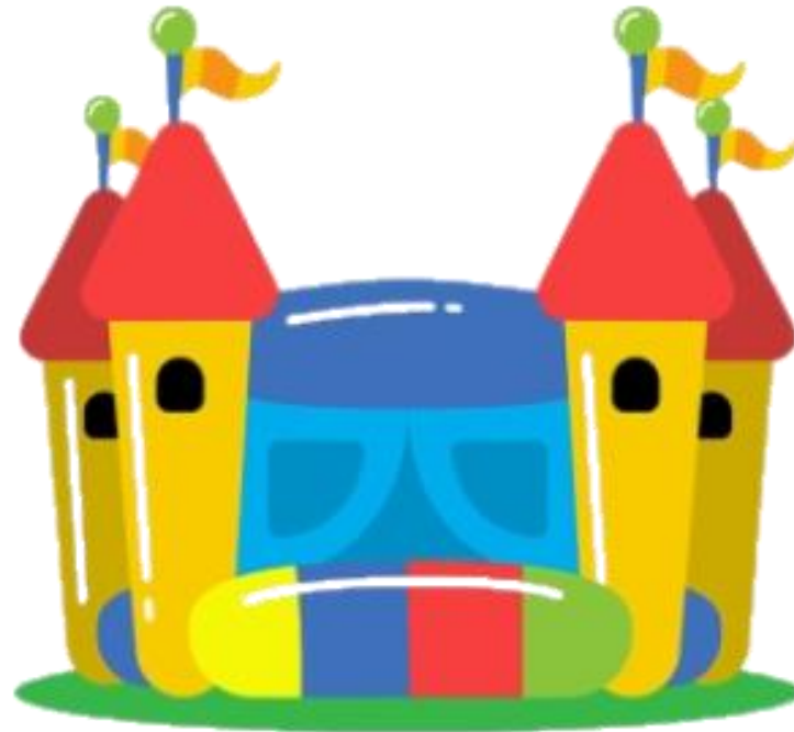
Inflatable Devices/Bouncy Houses