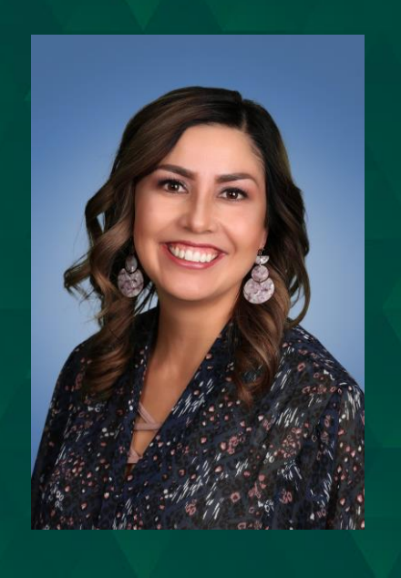
Dalila Boys Dodge City/Ford County